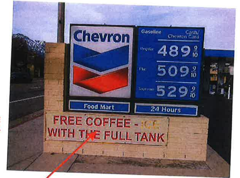
EXISTING D/F PRICE/ID SIGN

REMOVE EXISTING BANNER FROM PRICE SIGN BASE