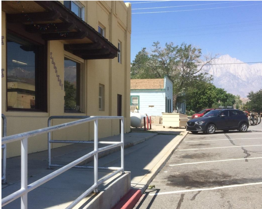
Photo 10: Bush and Jackson near Post Office and Senior Center. No sidewalks on east side of Jackson