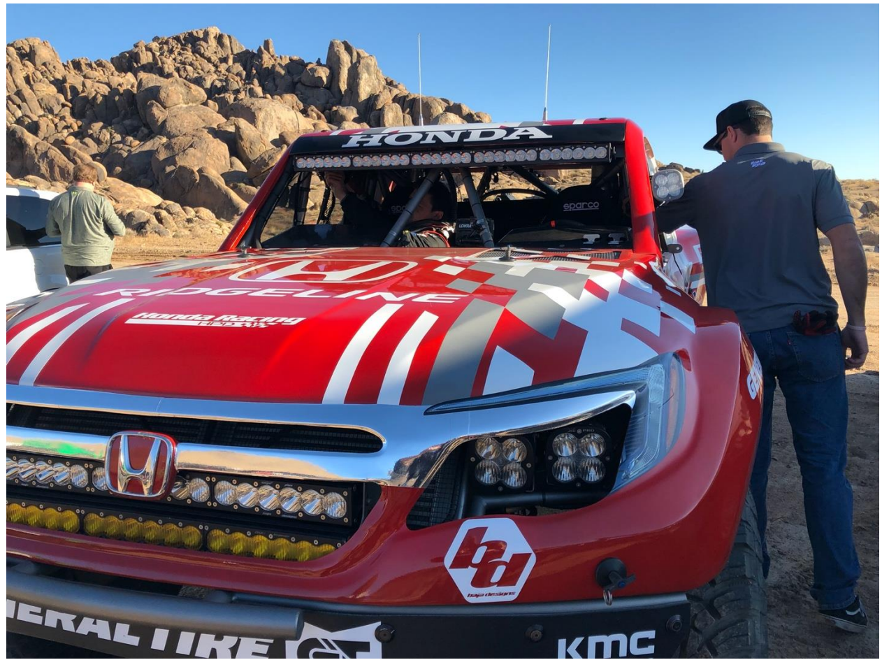
HONDA COMMERCIAL DECEMBER 2019. RIDGEBACK SPORTS VEHICLE

Christopher Langley Inyo County Film Commissioner Box 99 Lone Pine, CA. 93545 <u>lonepinemovies@aol.com</u> (760) 937 1189