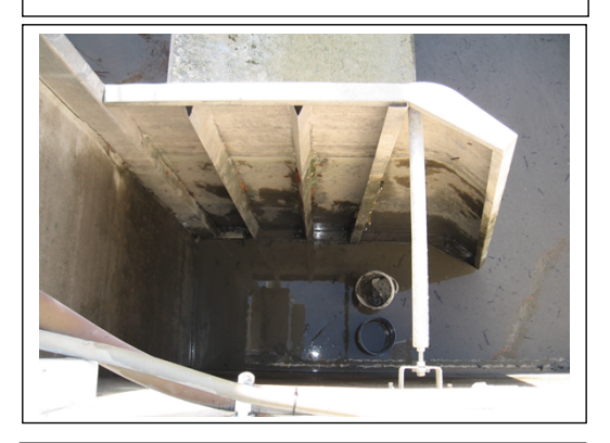
Top view of a LG side plate with stand-off bar. Although the LG was constructed of A304 stainless steel, the thin side plate metals were only plated stainless steel which corroded at seams & welds.