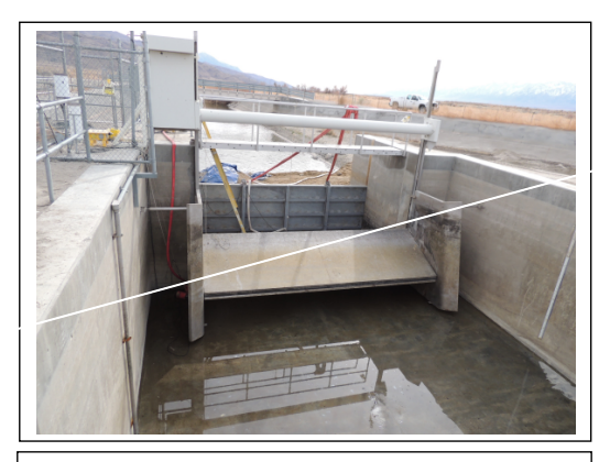
View of the cleaned and pressure-washed Langemann Gate ready for inspection . Note the downstream bulkhead gate and the dirt coffer dam preventing the river from flowing back into the sand trap.