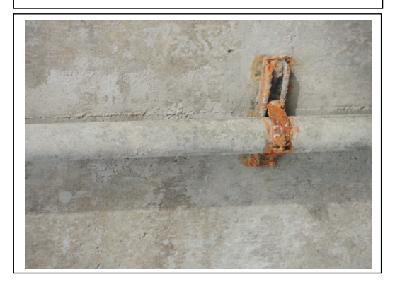
The communication pipe is A304 stainless steel, but the Uni-strut wall straps were only galvanized steel. All three wall brackets need to be replaced with A316 Stainless steel uni-strut and bolting.