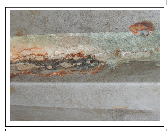
Typical rust-through holes in both of the original gate side plates. A quote of $ 9,900 dollars was received in 2016 for new side plates constructed of A316 corrosion-resistant Stainless Steel.