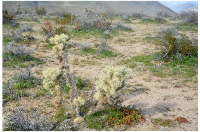
Silver Cholla (Opuntia echinocarpa) 3 of 3