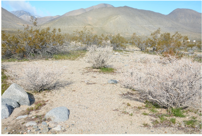
On Site Habitat 3 of 3

Mr. Luis Machado March 12, 2019 Page 9 of 9