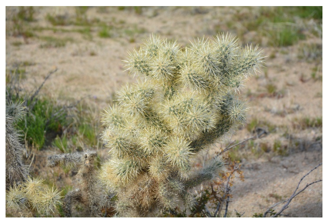
Silver Cholla ( Opuntia echinocarpa ) 2 of 3

Mr. Luis Machado March 12, 2019 Page 7 of 9