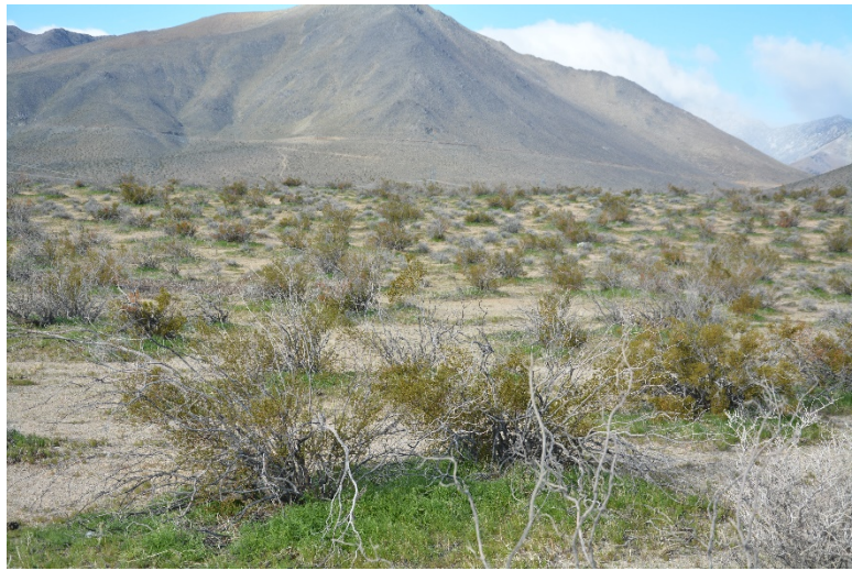
On Site Habitat 2 of 3

Mr. Luis Machado March 12, 2019 Page 8 of 9