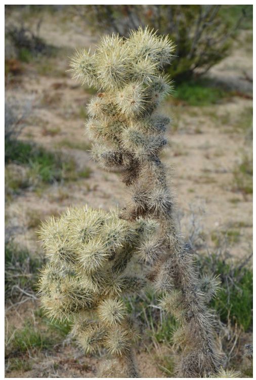
Silver Cholla ( Opuntia echinocarpa ) 1 of 3

Creosote, ( Larrea tridentata ) in background, White bursage (Ambrosia dumosa) in foreground.