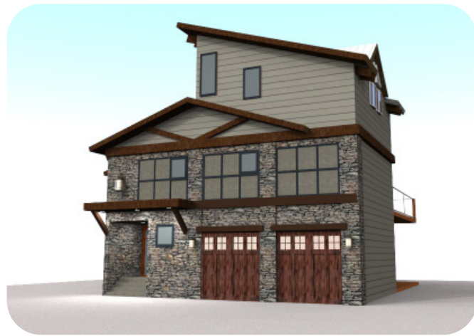
Mammoth Lakes Residence