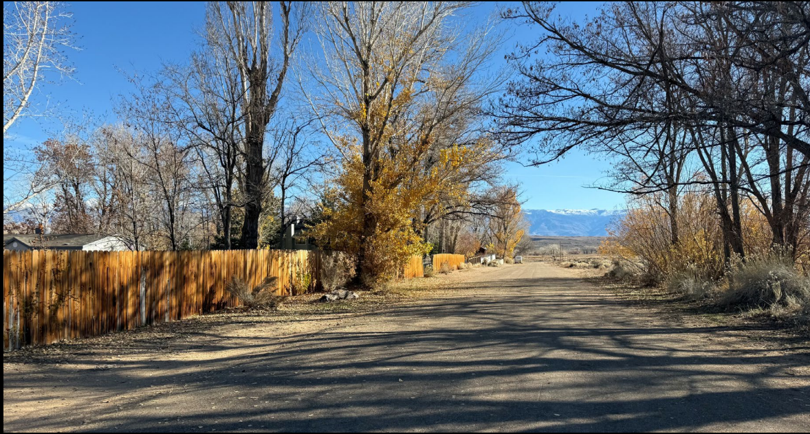
Neighborhood Context: Existing Front-Yard Fences in the Area That Exceed the 3.5-Foot Height Standard